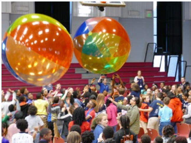
Students are engaged at the kickoff event where they learn, hands-on, the importance of civic participation so no one "drops the ball."

Service-Based Citizenship Patriotism Liberty Education Courage Perseverance Equality Responsibility Empathy Resourcefulness