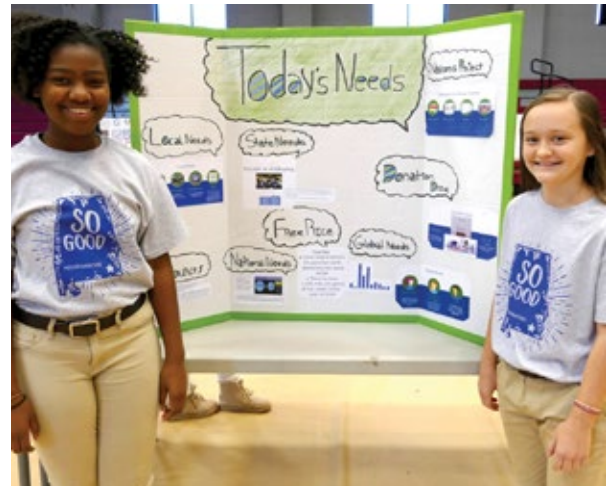
We don't just "tell" students they can make a difference like historic American figures. We ASK them how they'll make their own marks!